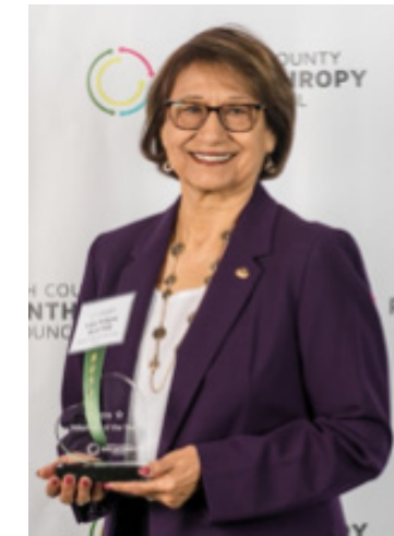
North County Philanthropy Council (NCPC): Certificate of Commendation