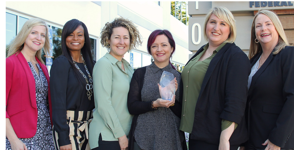
2019 Peter Barron Stark Companies' Award for Workplace Excellence – six consecutive bi-annual award!

Mission Fed is awarded and recognized for excellence in many areas of our work – from employee optimization to maintaining strong community relationships. We proudly accepted the following awards and recognition in 2019: