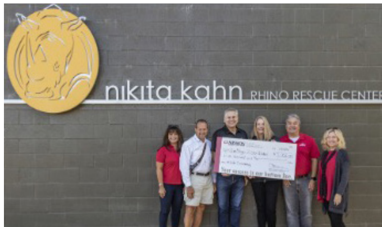
Kids Free in October – San Diego Zoo and Safari Park