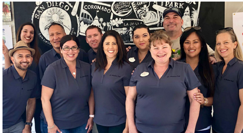
Mission Fed ArtWalk

At Mission Fed, our mission includes caring for our local San Diego community. We do this through strategic partnerships with educational and nonprofit organizations, financial education for all ages and community events. We are grateful for our many long-time community partners that we collaborate with every year to create a unique member experience by giving back to our community.