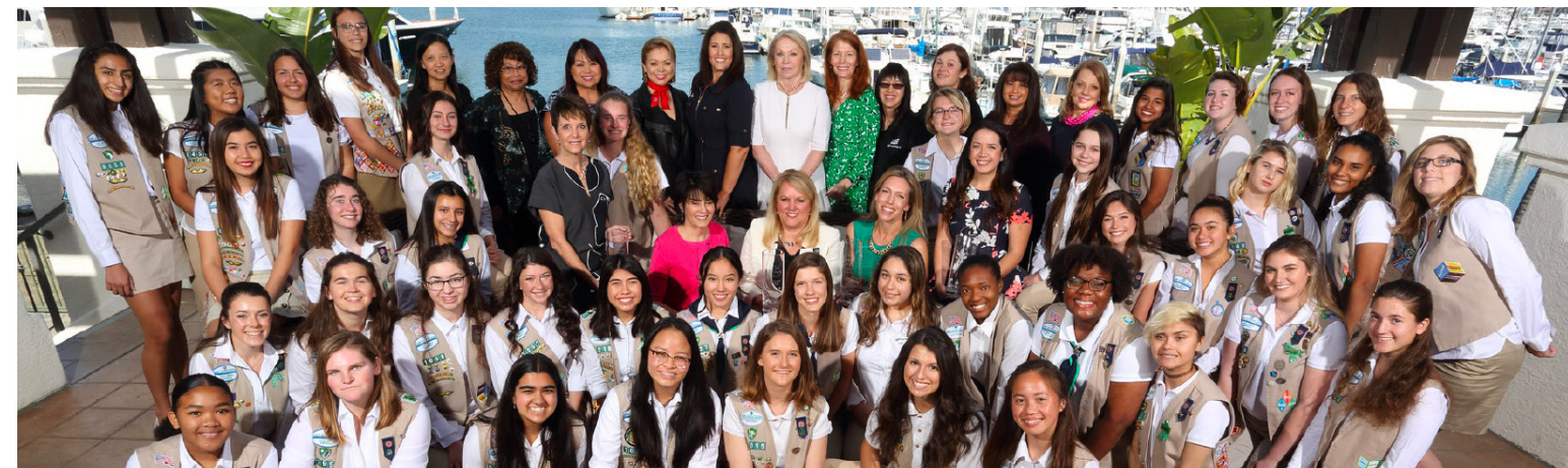
Girl Scout Volunteer Conference & Celebration – Girls Scouts San Diego