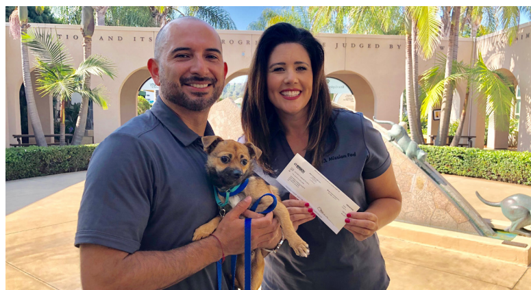
Clear the Shelters – San Diego Humane Society