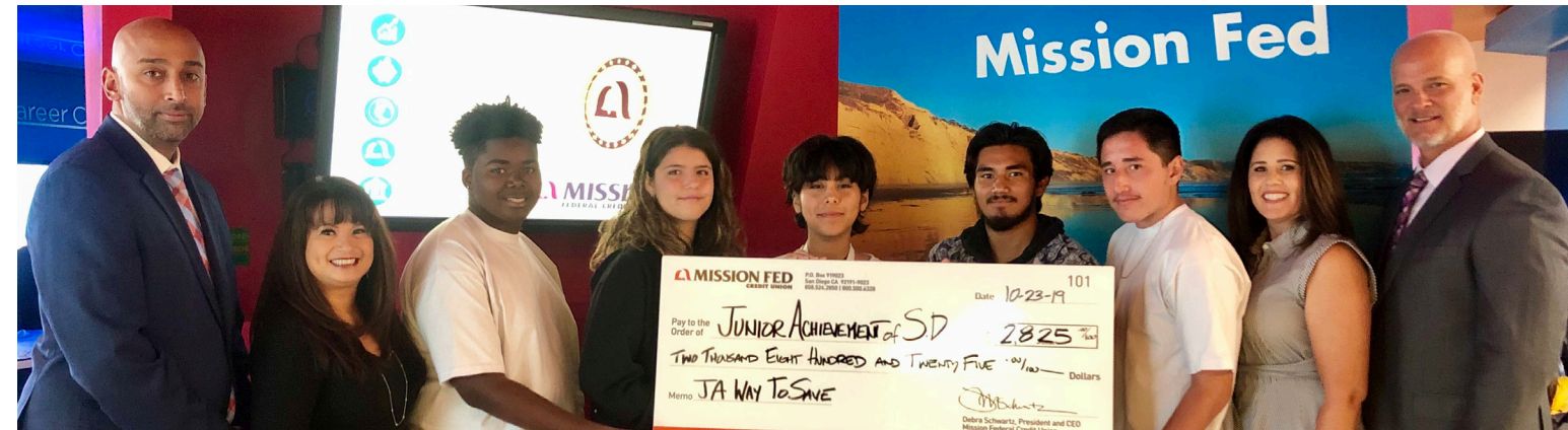
JA Way to Save – Junior Achievement San Diego