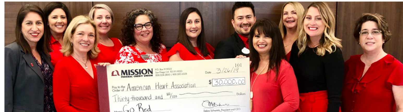
Go Red for Women – American Heart Association